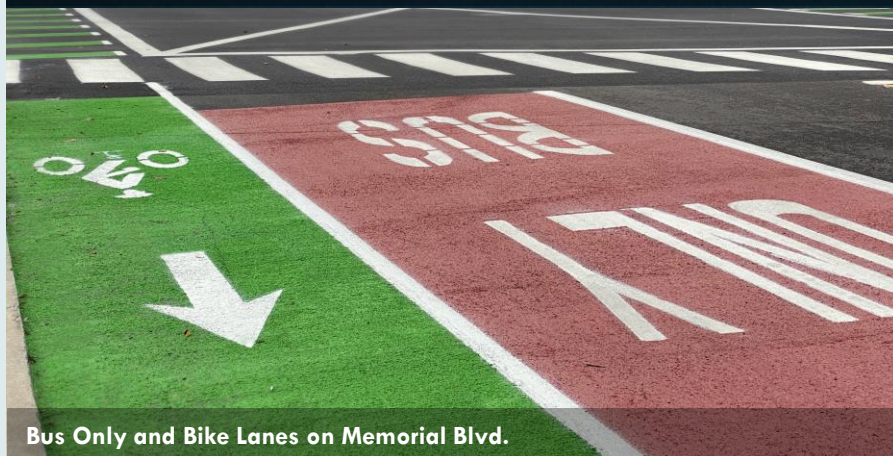
Bus Only and Bike Lanes on Memorial Blvd.