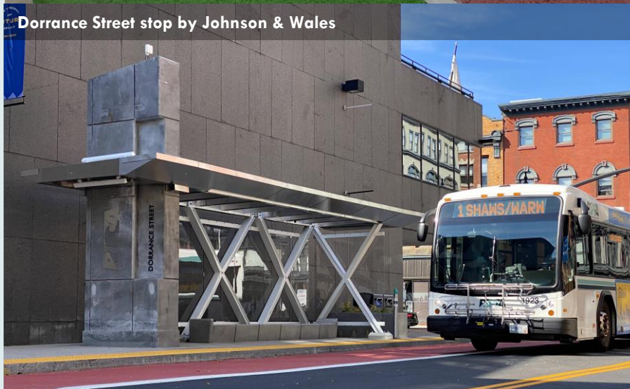
Dorrance Street stop by Johnson & Wales