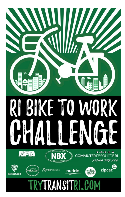
MAY 20-JUNE 30, 2016

So, how do you wrap a roughly 40-foot bus? It takes a two-person crew at least six hours, a lot of patience and a lot precision. Thanks to our friends at Atom Media Group you can watch the whole process condensed into about 30 seconds. Enjoy!