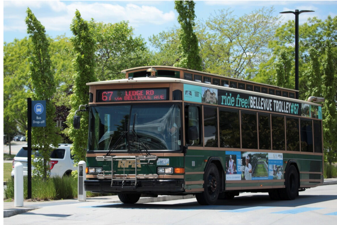
Green and gold RIPTA Trolley at Newport Transportation Center

Rhode Island , passengers can hop-on and hop-off these two routes through October 31, 2023 at no charge.