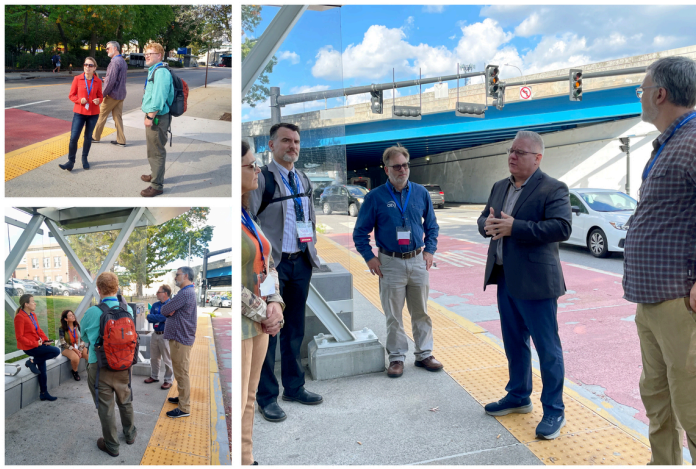
RIPTA Planners show visiting planners some of the user friendly features of our high-frequency bus corridor in downtown Providence.

When about 400 planners from throughout New England came to Rhode Island last month for the annual conference of the Southern New England American Planning Association (SNEAPA), they discussed a wide range of topics including, land use,