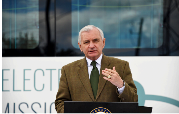
Senator Reed at RIPTA speaking about The Clean Transit American Plan which would dedicate funding to electrify public transit fleets nationwide.

U.S. Senator Jack Reed was at RIPTA recently to talk about a bold new proposal that will dedicate $73 billion in federal funds to electrify the nation's approximately 70,000 public transit buses. With electric buses costing nearly double the price of regular bus, a clear vision and strong support from the federal government are essential if individual transit agencies are to build greener fleets. Greg Nordin, RIPTA's Chief of Strategic Advancement, thanked Senator Reed for his commitment to the future of public transportation. "We are grateful for his foresight and advocacy," Nordin said. "We could not do this alone."