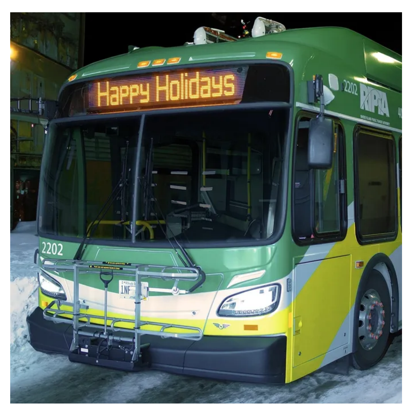
RIPTA bus with a "Happy Holidays" overhead sign.