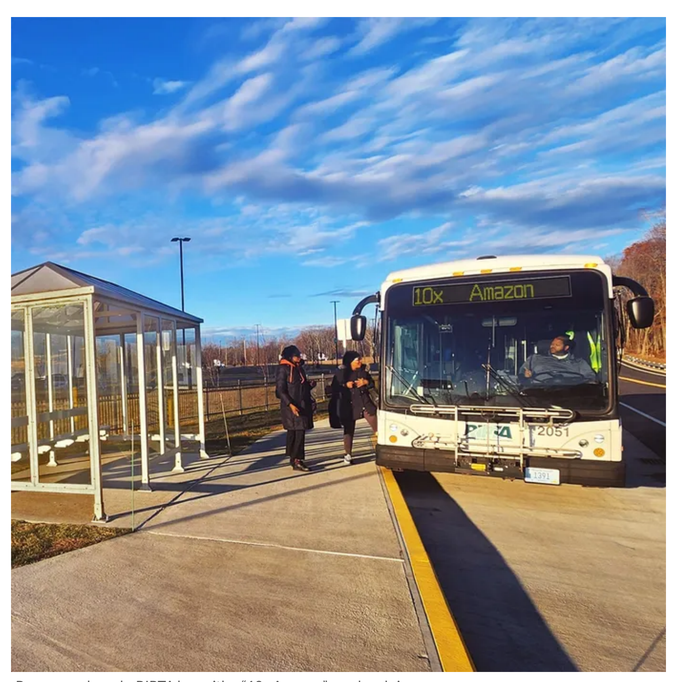
Passengers board a RIPTA bus with a "10x Amazon" overhead sign.

<u>Click here</u> to read more about the mother of the modern-day civil rights movement in America.