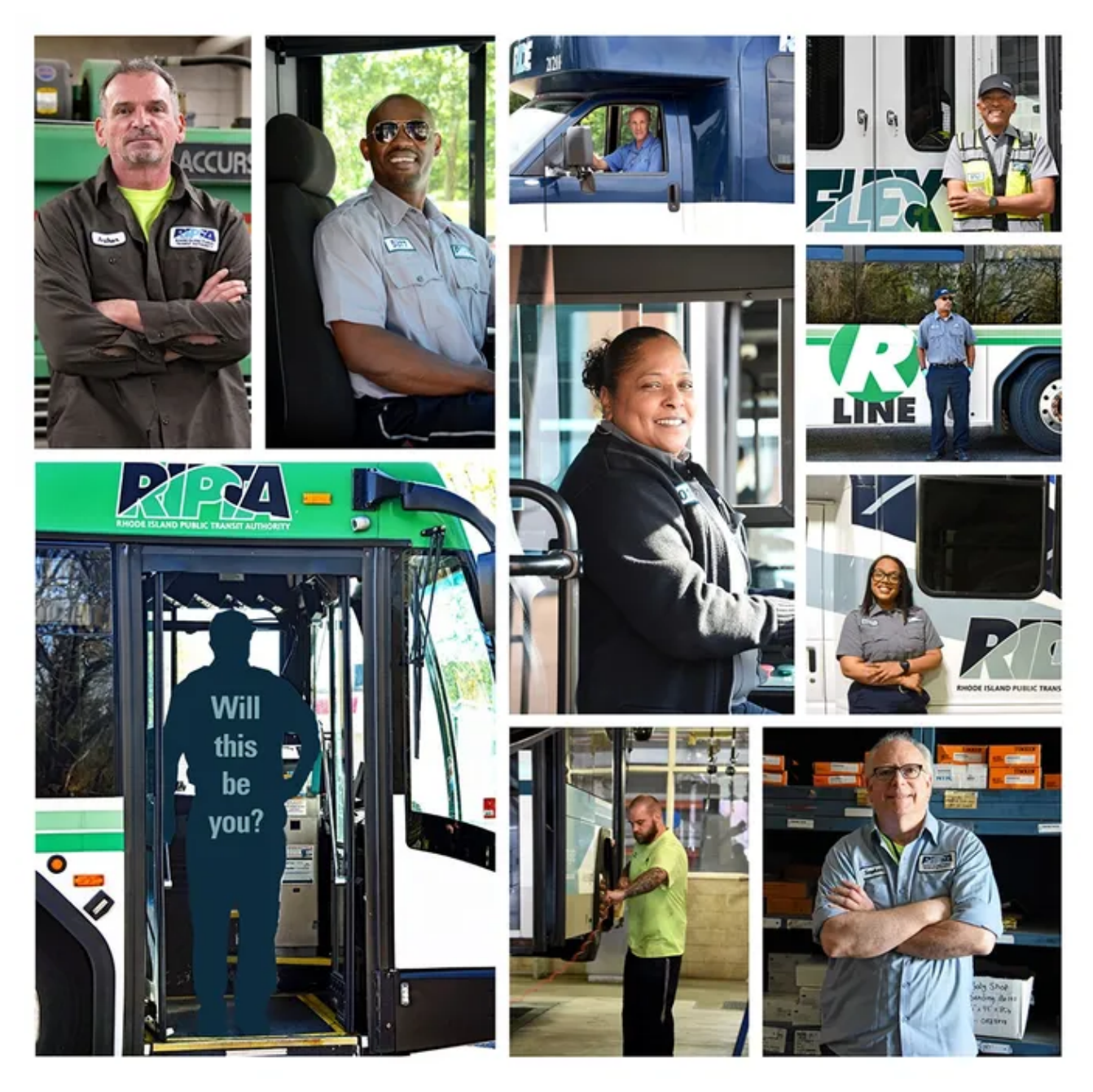
Collage of RIPTA employees with empty outline of one person labeled "Will this be you?"