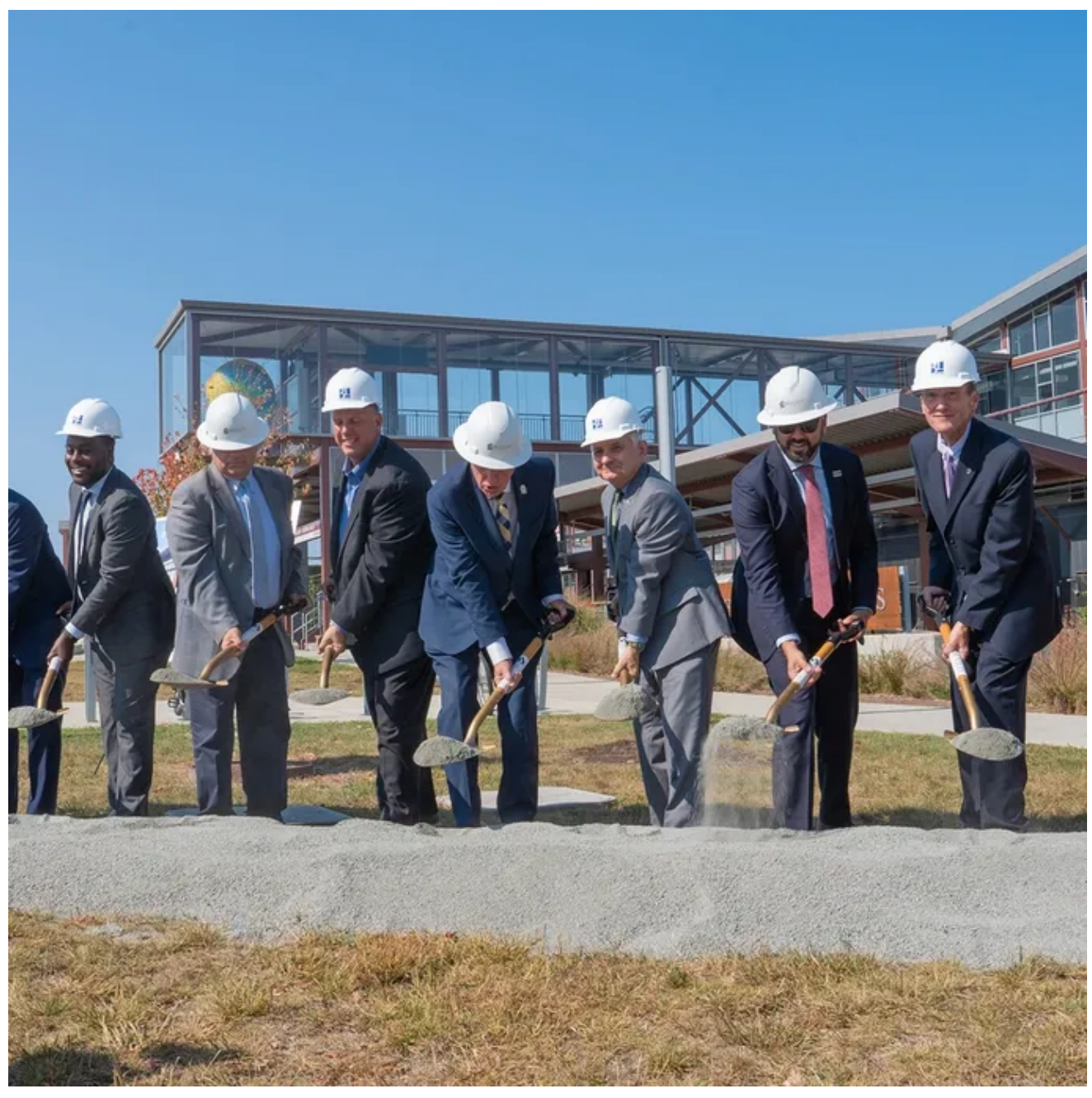
RIPTA, Federal, State, and Local Leaders ceremoniously shovel dirt in front of the Pawtucket-Central Falls Transit Center.