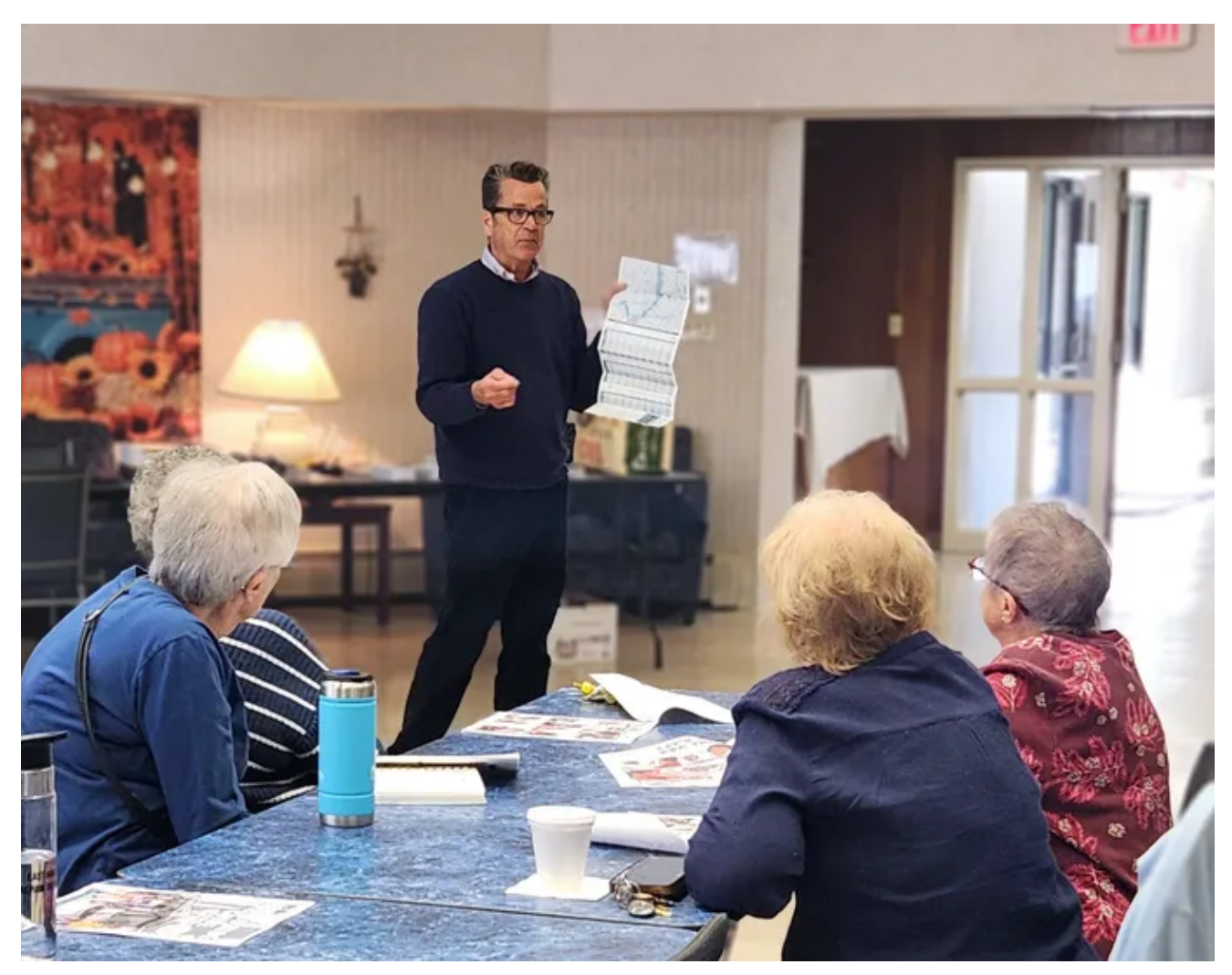
RIPTA employee teaching a group about transit.

Applications must be received by March 21, 2025. For a full list of open positions, including drivers, visit <u>RIPTA.com/careers</u>.