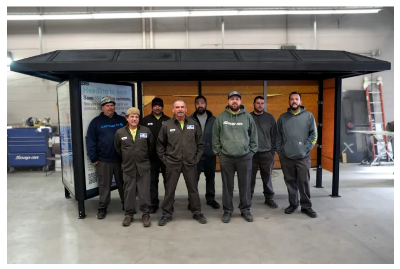
RIPTA Body Shop team standing in front of a newly rehabbed bus shelter.